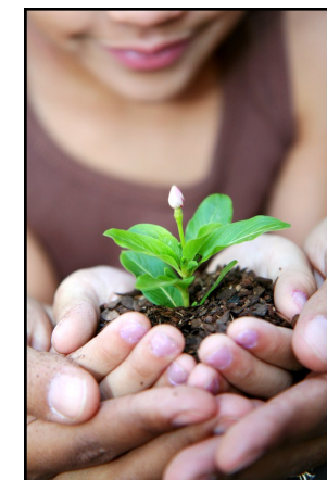
Planting seeds of faith

Monthly observance of the Lord's Supper will resume the first Sunday in September.